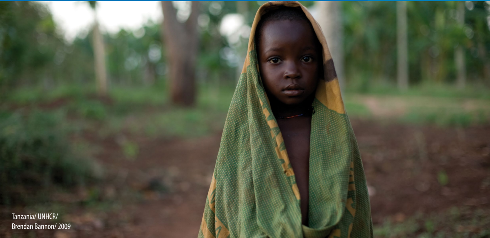
Tanzania/ UNHCR/ Brendan Bannon/ 2009

Through the Alternatives to Camps Series, UNHCR provides key guidance, useful approaches, tools and good practices to support the implementation of the key actions outlined in the Policy on Alternatives to Camps . The Series also includes a call for sharing your good practices.