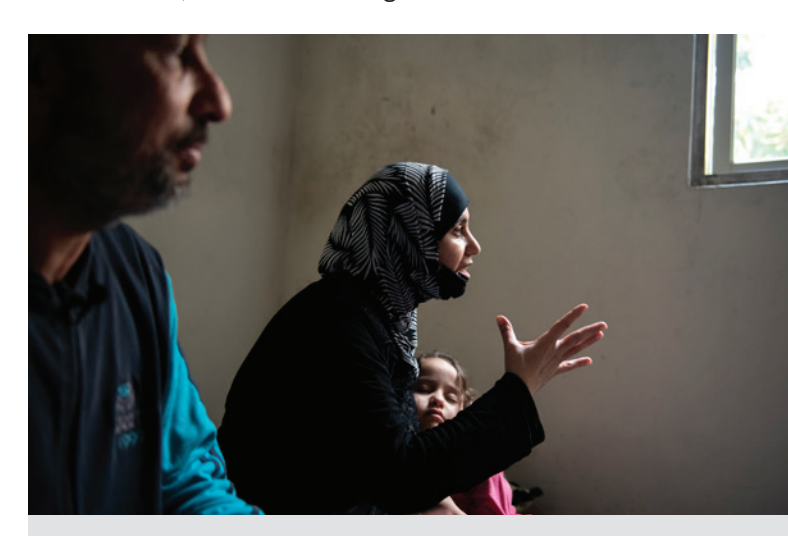
Lebanon. Ten years into Syria crisis, refugee family struggling with poverty and mental health issues

MHPSS is also relevant for other goals such as SDG 16 on Justice, Peace and Stronger Institutions.