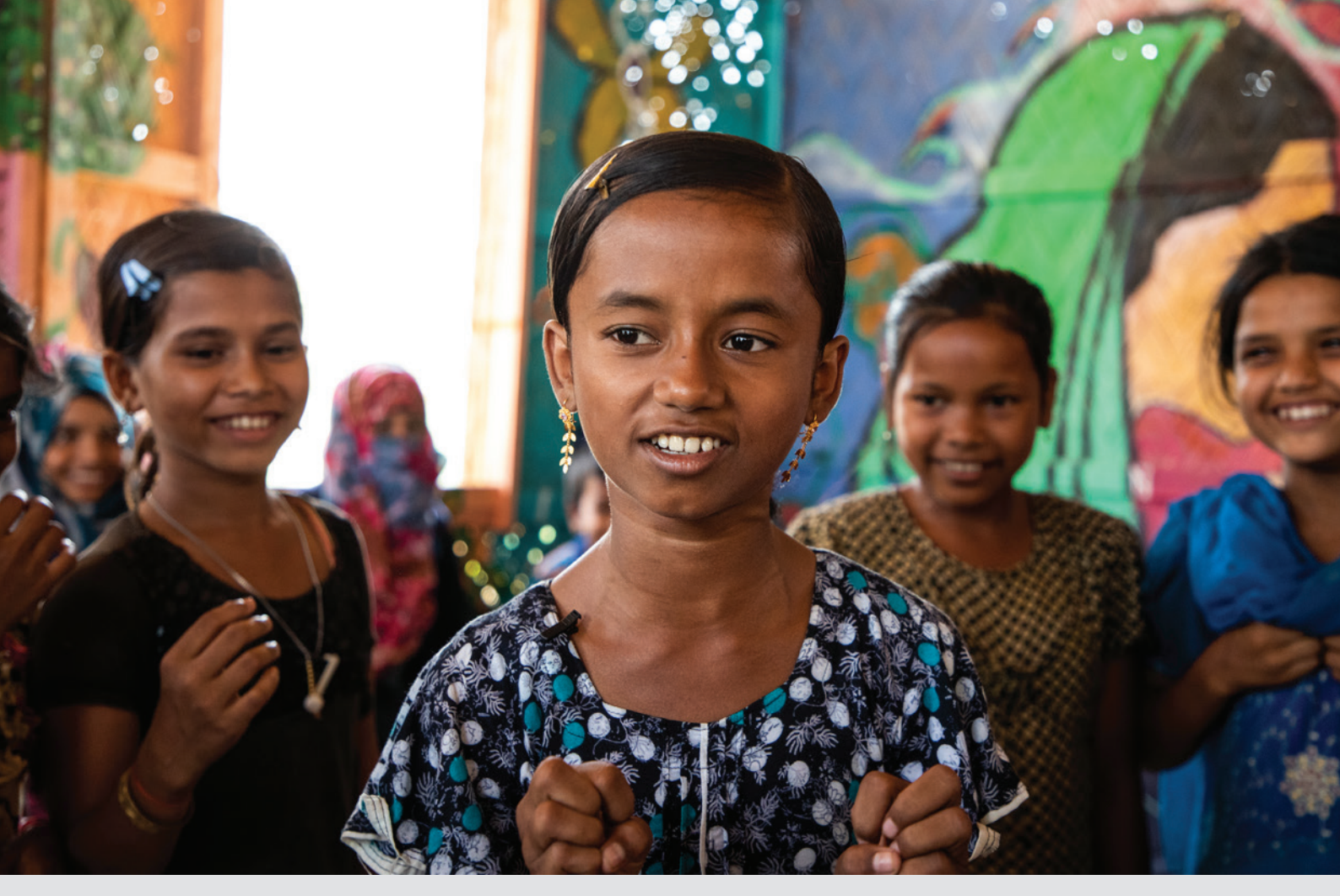
Bangladesh. Mental health project helps Rohingya youths discuss anxieties